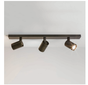
CODE: 1286006 FINISH: BRONZE