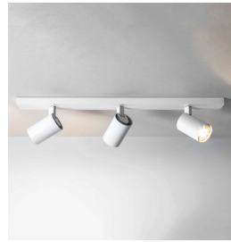
CODE: 1286003 FINISH: TEXTURED WHITE