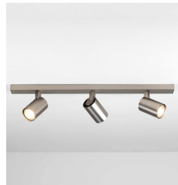
CODE: 1286013 FINISH: MATT NICKEL

TO MAINTAIN THIS PRODUCT TO ITS BEST CONDITION, PLEASE VIEW OUR CARE AND CLEANING GUIDE ON THE SUPPORT SECTION OF THE ASTRO WEBSITE.