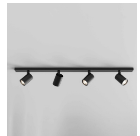
CODE: 1286084 FINISH: MATT BLACK

TO MAINTAIN THIS PRODUCT TO ITS BEST CONDITION, PLEASE VIEW OUR CARE AND CLEANING GUIDE ON THE SUPPORT SECTION OF THE ASTRO WEBSITE.