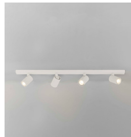
CODE: 1286007 FINISH: TEXTURED WHITE