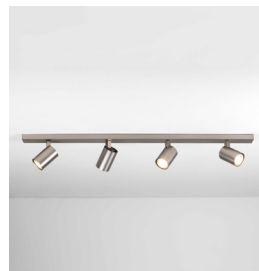
CODE: 1286014 FINISH: MATT NICKEL