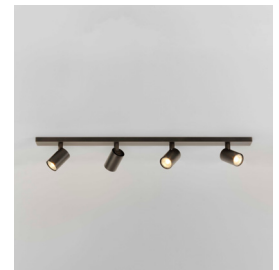
CODE: 1286008 FINISH: BRONZE