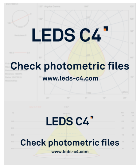
Image may not match reference. LedsC4 reserves the right to amend any of the product's components. The data related to flux, power and colour temperature may be subject to changes made by the manufacturer.