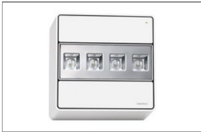
ATRIA 22 (AT,B)