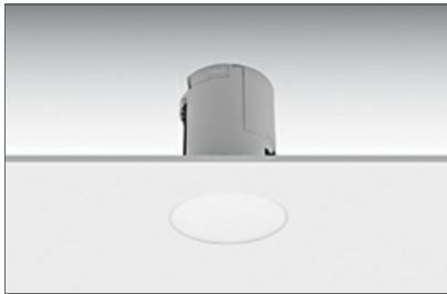
Lens (SEN) CC