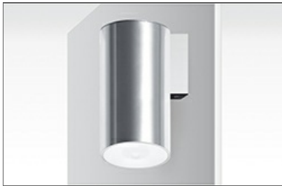
Lens (ESP, AEX) CC