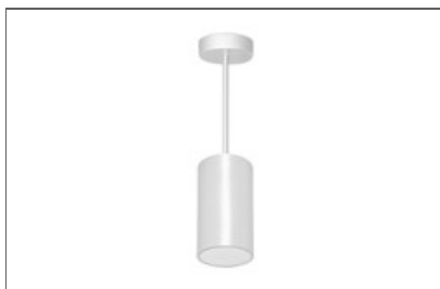
Lens (S) CC