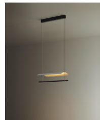
Lámina 45 / 85