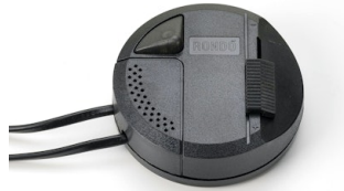
RF28045 Led rondo' dimmer 220/240v 40- 250w 4-100w