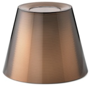
F6298046 Aluminized bronze diffuser assembly