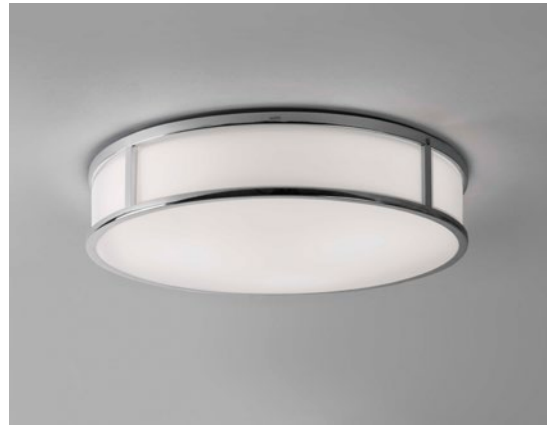
CODE: 1121026 FINISH: POLISHED CHROME

TO MAINTAIN THIS PRODUCT TO ITS BEST CONDITION, PLEASE VIEW OUR CARE AND CLEANING GUIDE ON THE SUPPORT SECTION OF THE ASTRO WEBSITE.