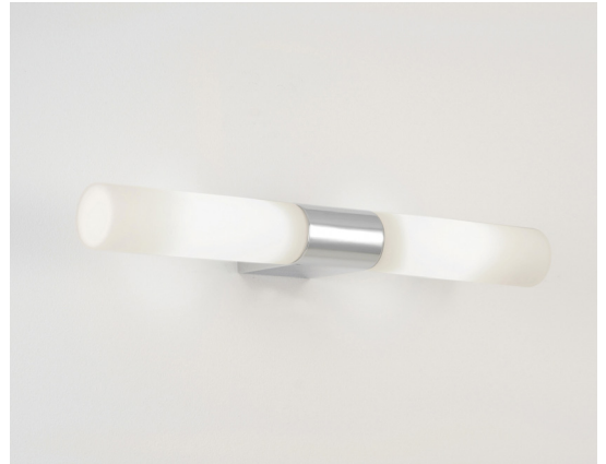
CODE: 1143001 FINISH: POLISHED CHROME

TO MAINTAIN THIS PRODUCT TO ITS BEST CONDITION, PLEASE VIEW OUR CARE AND CLEANING GUIDE ON THE SUPPORT SECTION OF THE ASTRO WEBSITE.