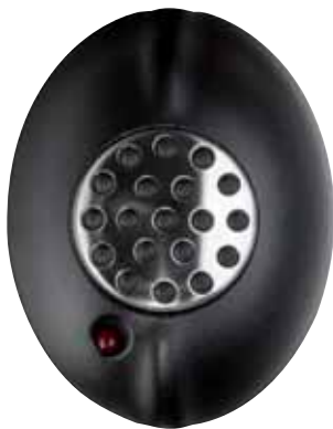
CROSS LED F-N Cod. RL0015/LAMPS