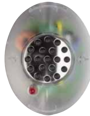
CROSS LED F-T Cod. RL0038/LAMPS