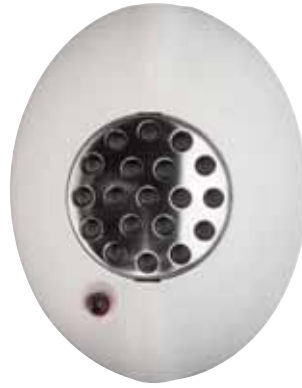
CROSS LED F-B Cod. RL0023/LAMPS