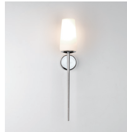
CODE: 1388001 + 5033005 FINISH: POLISHED CHROME