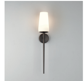
CODE: 1388002 + 5033005 FINISH: BRONZE

TO MAINTAIN THIS PRODUCT TO ITS BEST CONDITION, PLEASE VIEW OUR CARE AND CLEANING GUIDE ON THE SUPPORT SECTION OF THE ASTRO WEBSITE.