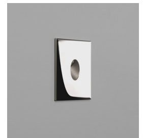
CODE: 1175005 FINISH: POLISHED STAINLESS STEEL

TO MAINTAIN THIS PRODUCT TO ITS BEST CONDITION, PLEASE VIEW OUR CARE AND CLEANING GUIDE ON THE SUPPORT SECTION OF THE ASTRO WEBSITE.