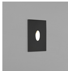
CODE: 1175004 FINISH: TEXTURED BLACK