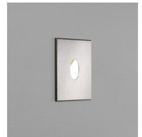
CODE: 1175002 FINISH: BRUSHED STAINLESS STEEL