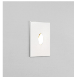
CODE: 1175001 FINISH: MATT WHITE