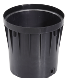
Box for installation F4599000