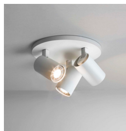
CODE: 1286002 FINISH: TEXTURED WHITE