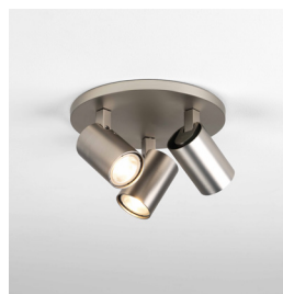
CODE: 1286012 FINISH: MATT NICKEL

TO MAINTAIN THIS PRODUCT TO ITS BEST CONDITION, PLEASE VIEW OUR CARE AND CLEANING GUIDE ON THE SUPPORT SECTION OF THE ASTRO WEBSITE.