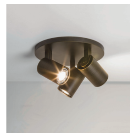
CODE: 1286005 FINISH: BRONZE