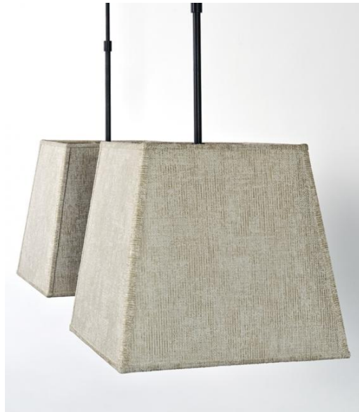
MEREROUKA 2 in brushed bronze with lampshades in Trento ficelle (fabric from category 3)