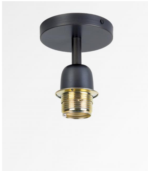
KENTIKA E27 in brushed bronze