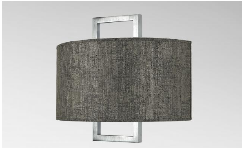
KARANIS 2 in brushed chrome with lampshade in Trento lave (fabric from category 3)