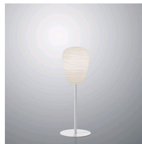
Rituals 1 Mix&Match