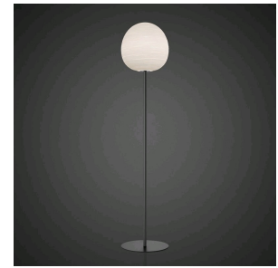
Rituals XL Mix&Match