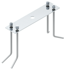
Base plate with bolt F015Z010000