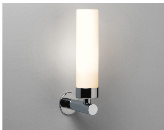
CODE: 1021001 FINISH: POLISHED CHROME

TO MAINTAIN THIS PRODUCT TO ITS BEST CONDITION, PLEASE VIEW OUR CARE AND CLEANING GUIDE ON THE SUPPORT SECTION OF THE ASTRO WEBSITE.