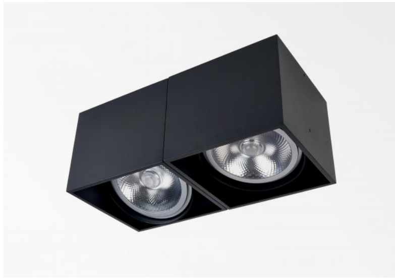
ATRIA 2 MOBILE in structured black