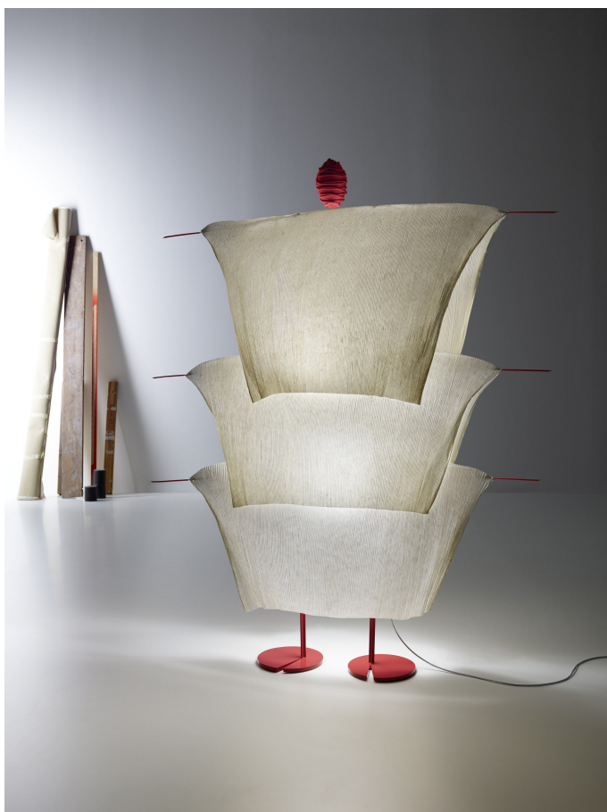
Walking In The Rain INGO MAURER UND TEAM 2017

Paper, metal, stainless steel, silicone. "Walking In The Rain" is a large, sculptural light object standing on two red feet. Three sheets of paper are arranged one above the other and remind of a cloak. The inspiration for this exclusive fixture comes from traditional Japanese raincoats woven from straw, which explains its appearance of a figure with feet and a head. Like all papers of the MaMo Nouchies series, the lampshade consists of Japanese paper, which is treated in several steps in Dagmar Mombach's factory until it reaches the desired shape. For Walking In The Rain a lot of the unique paper material is being used. Inside, two LED modules with a cooling element are installed. The module was developed by Ingo Maurer especially for the MaMo Nouchies. The light is warm and soft, and can hardly be distinguished from conventional halogen light. The paper sheets act as light diffusers. Walking In The Rain's friendly presence provides more than light.