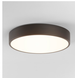
CODE: 1125016 FINISH: BRONZE

TO MAINTAIN THIS PRODUCT TO ITS BEST CONDITION, PLEASE VIEW OUR CARE AND CLEANING GUIDE ON THE SUPPORT SECTION OF THE ASTRO WEBSITE.