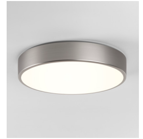
CODE: 1125015 FINISH: MATT NICKEL