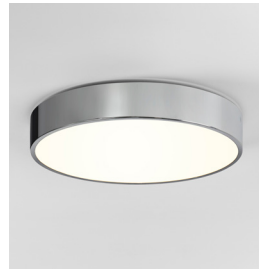
CODE: 1125014 FINISH: POLISHED CHROME