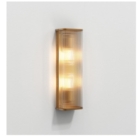
CODE: 1427012 FINISH: ANTIQUE BRASS

TO MAINTAIN THIS PRODUCT TO ITS BEST CONDITION, PLEASE VIEW OUR CARE AND CLEANING GUIDE ON THE SUPPORT SECTION OF THE ASTRO WEBSITE.