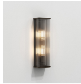
CODE: 1427011 FINISH: BRONZE