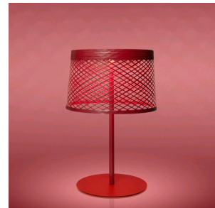
Twigggy Grid XL