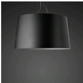
Twice as Twigggy