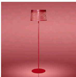
Twigggy Grid Lettura