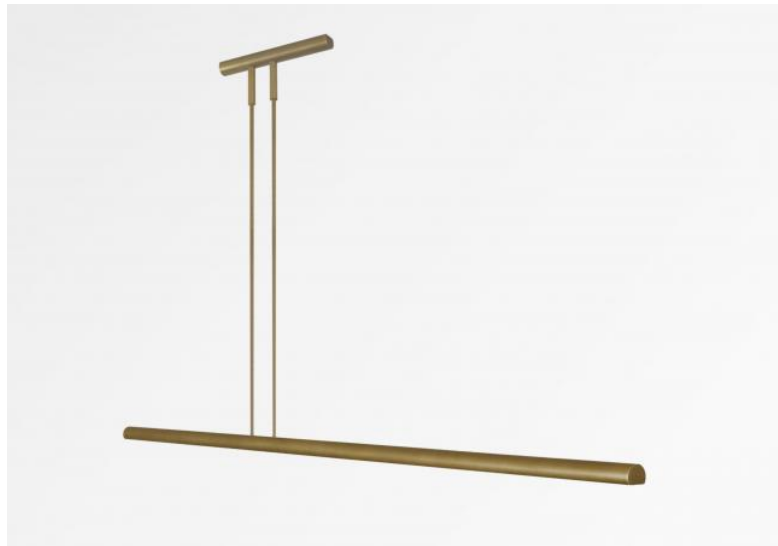
AXELL 90 in light bronze