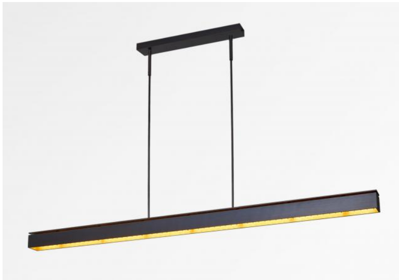
GALAND J tubes in brushed bronze