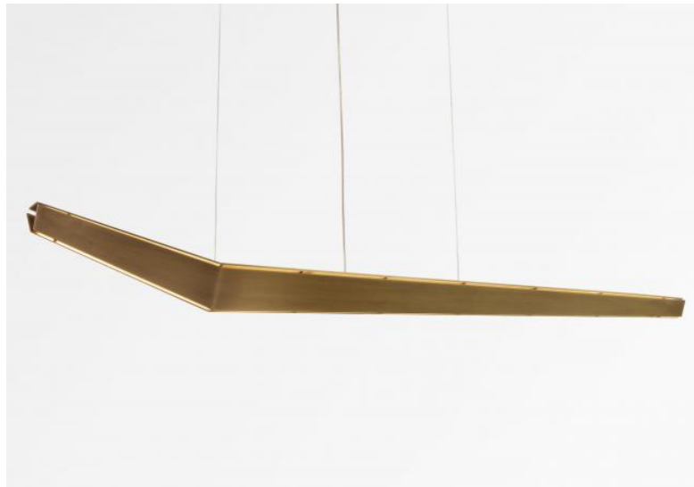
LUNGA # in light bronze