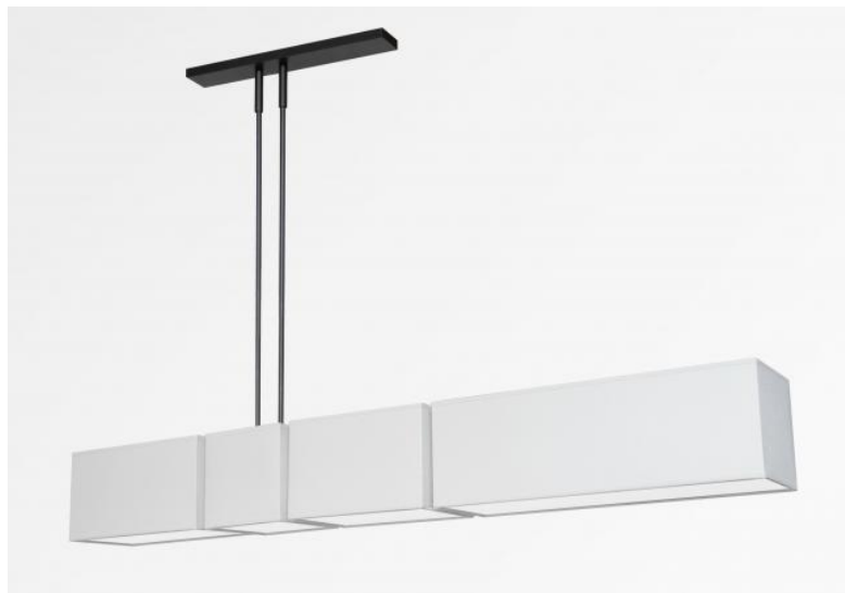
WRIGHT in brushed bronze with lampshades in Madison naturel (fabric from category 2)