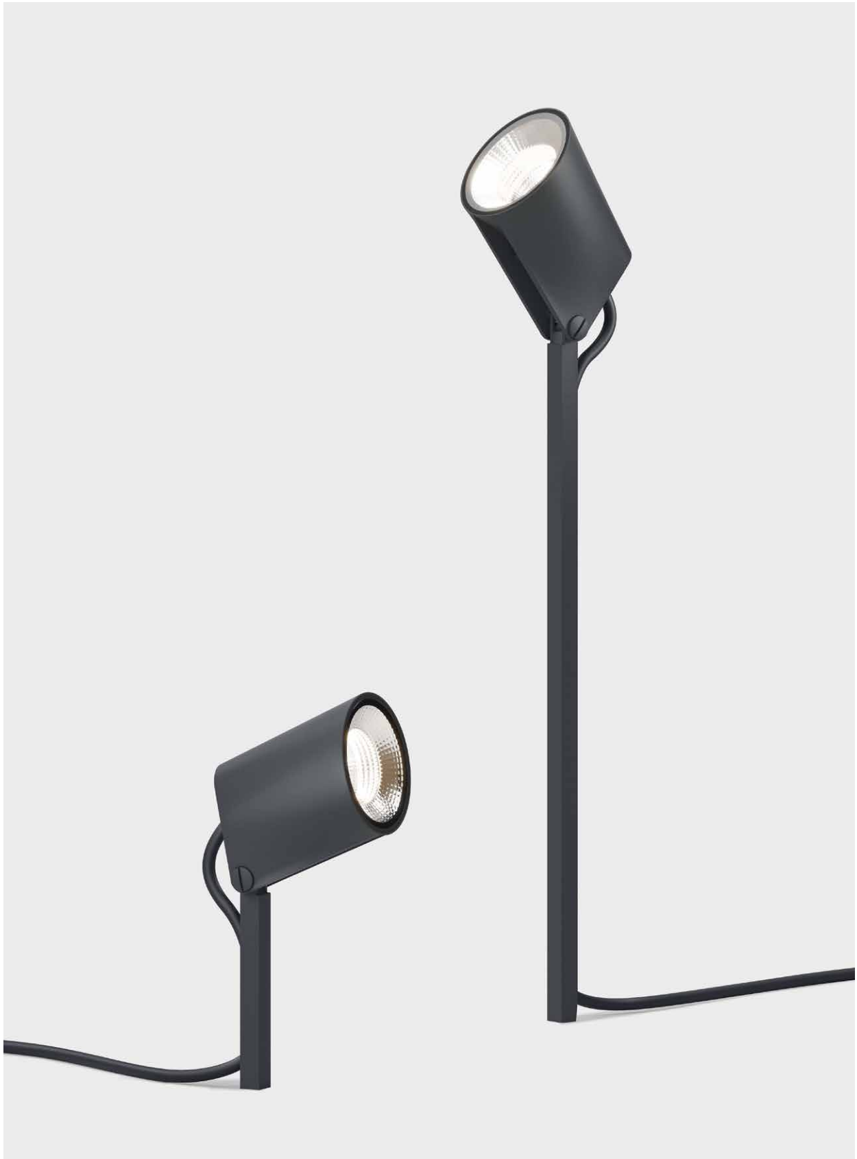
stic spike Design: Klaus Nolting