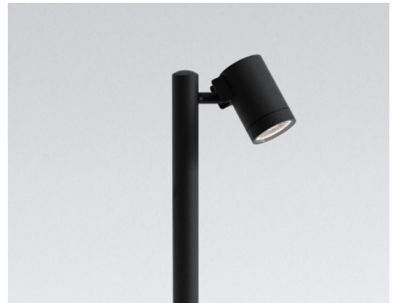
CODE: 1401012 FINISH: TEXTURED BLACK

THIS PRODUCT IS SUITABLE FOR ONEROUS ENVIRONMENTS AND CAN BE INSTALLED WITHIN FIVE MILES OF THE COAST - THREE YEAR WARRANTY APPLIES.