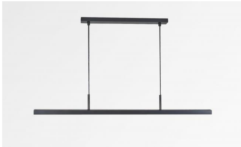
POLARIUS 90 in brushed bronze