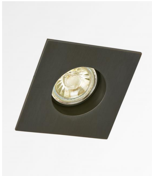
RIVERSIDE 1 in brushed bronze