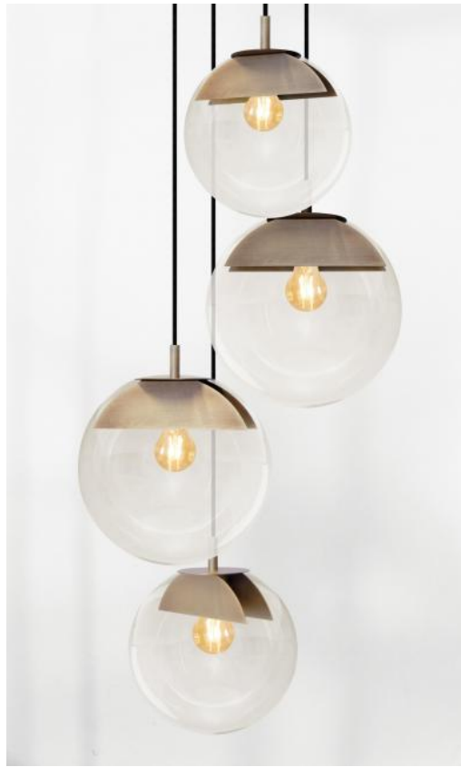
LUNA 4 o26 in light bronze (code 28) with transparent glasses (code 80)