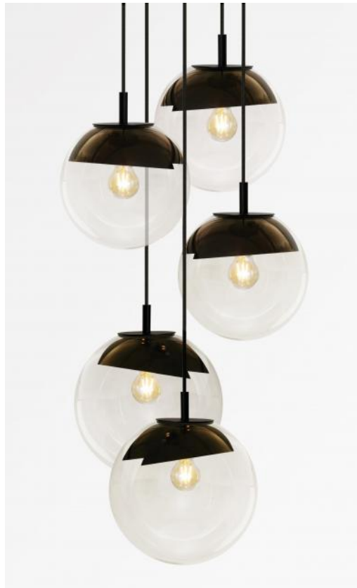
LUNA 5 o26 in structured black (code 02) with transparent glasses (code 80)