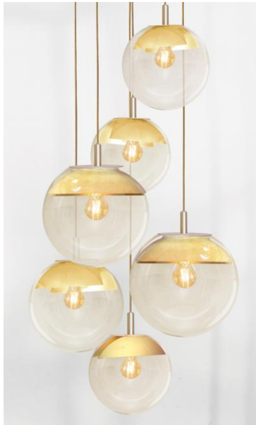
LUNA 6 ø38 in brushed brass (code 25) with transparent glasses (code 80)