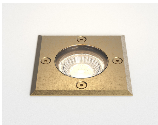
CODE: 1312009 FINISH: SOLID BRASS

THIS PRODUCT IS NOT SUITABLE FOR INSTALLATION WITHIN FIVE MILES OF THE COAST. FOR THESE ENVIRONMENTS, PLEASE FILTER PRODUCTS ON THE ASTRO WEBSITE BY 'COASTAL'.