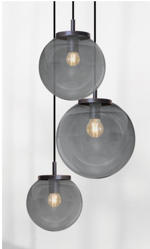
FORYOU 3 o26 in brushed bronze (code 29) with anthracite glasses (code 82)