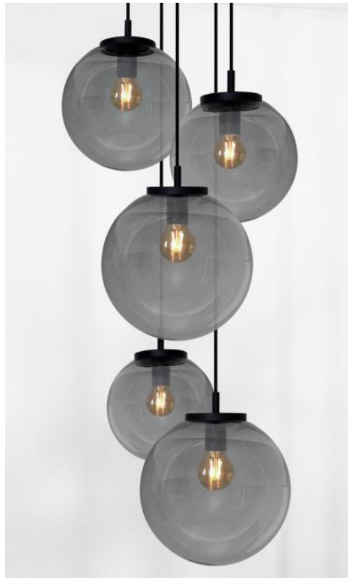
FORYOU 5 o33 in structured black (code 02) with anthracite glasses (code 82)