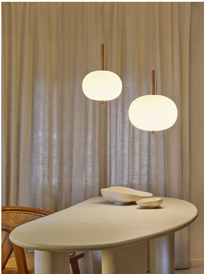
Image may not match reference. LedsC4 reserves the right to amend any of the product's components. The data related to flux, power and colour temperature may be subject to changes made by the manufacturer.