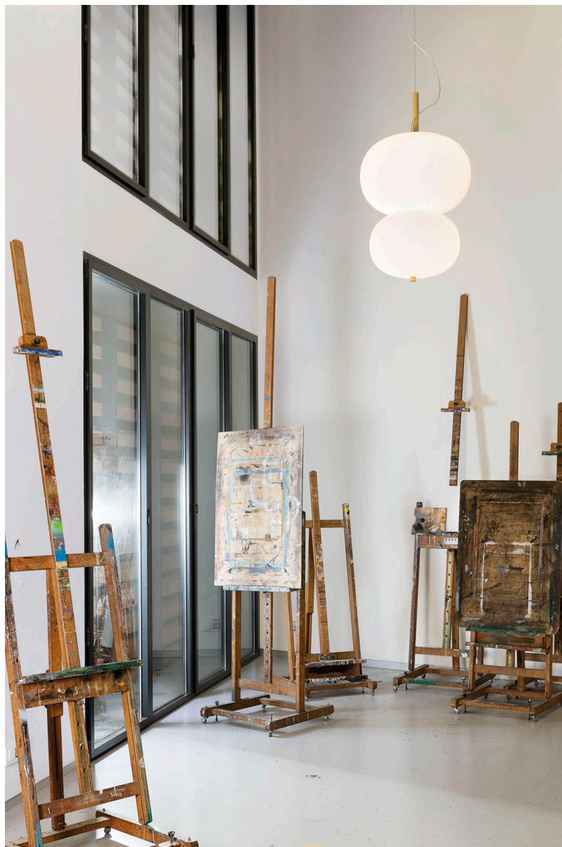
Image may not match reference. LedsC4 reserves the right to amend any of the product's components. The data related to flux, power and colour temperature may be subject to changes made by the manufacturer.