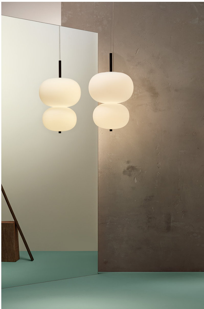
Image may not match reference. LedsC4 reserves the right to amend any of the product's components. The data related to flux, power and colour temperature may be subject to changes made by the manufacturer.